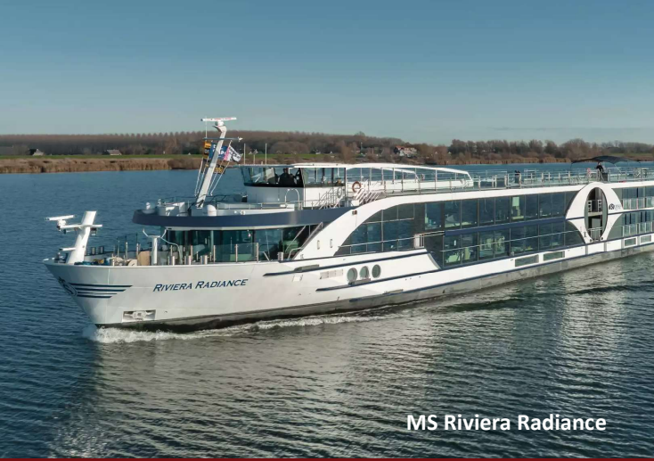
MS Riviera Radiance