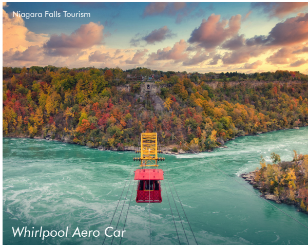
Whirlpool Aero Car