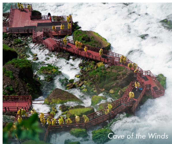
Cave of the Winds

Following breakfast, uncover the charm of rural life at Cinnamon Ridge Farms and learn about sustainable farming practices. Wander the scenic grounds, interact with friendly animals, and gain insight into daily farm operations from knowledgeable guides. Don't miss out on a delicious cheese tasting featuring farm-made specialties! After the tour, we'll complete our journey home.