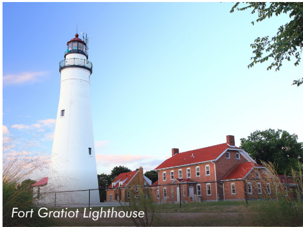
Fort Gratiot Lighthouse