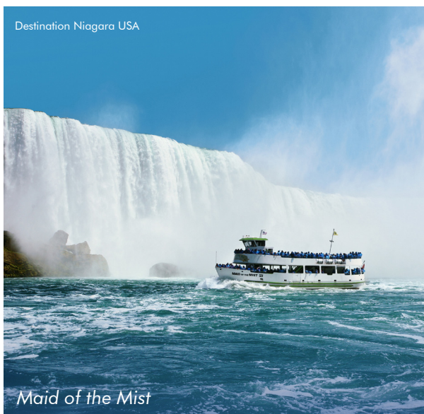
Maid of the Mist