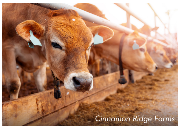
Cinnamon Ridge Farms