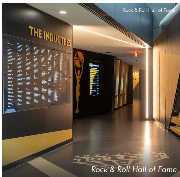
Rock &amp; Roll Hall of Fame