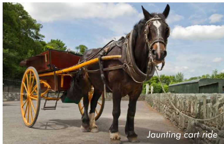
Jaunting cart ride