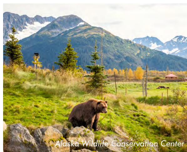
Alaska Wildlife Conservation Center

Visit www.ncl.com/shore-excursions to see available shore excursions. Pre-book by logging in or creating an online account or by calling the Norwegian Excursion line at 866-625-1167.