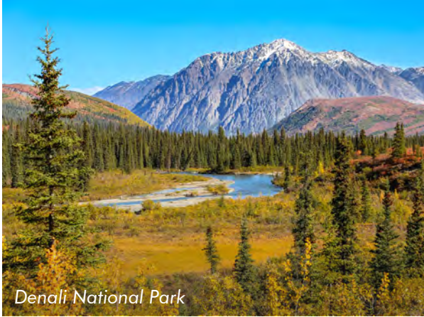
Denali National Park

All aboard for a spectacular day of rail and wilderness adventure! We settle into our deluxe dome railcar and travel toward the charming town of Talkeetna, surrounded by ever-changing scenery. Beneath soaring glass ceilings, savor a freshly prepared breakfast while our onboard guide brings the region to life with captivating stories of its past, terrain, and native wildlife. Along the way, keep watch over forested hills and winding river valleys for sightings of moose and soaring eagles, with the possibility of Denali rising in the distance. Tonight we will check in to Denali Park Village (or similar).