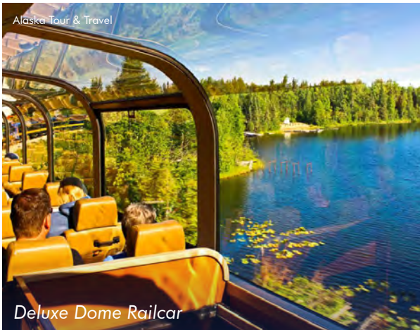
Deluxe Dome Railcar

Enjoy a panoramic drive to Seward this morning, revealing a landscape of rugged cliffs, alpine scenery, and glistening inlets. A stop at the Alaska Wildlife Conservation Center gives us a close-up view of Alaska's most recognizable animals, including bears, moose, and wolves, all cared for in a protected, natural habitat. In Seward, experience the excitement of dog mushing at a local kennel to learn about the legendary Iditarod Trail Sled Dog Race and meet the dedicated sled dogs and lively puppies that power this enduring tradition. The night is free to enjoy at our own pace, with dinner on our own before settling in for a comfortable stay at Hotel Edgewater (or similar).